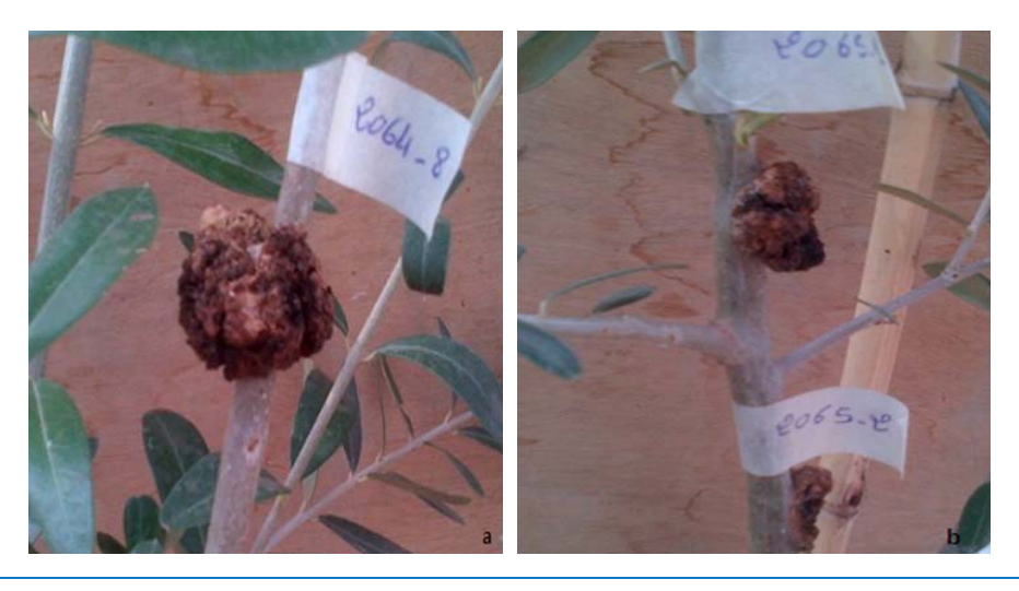
Figure-2. Symptoms on 1-year-old olive stems (Picholine marocaine) 60 days after inoculation with isolates 2064-8(a) and 2065-1, 2065-2 (b)

According to the OPAT tests, the 2074-1 and 2074-4 isolates were able to product Levan and positives for Oxidase, Pectinase and Arginine dihydrolase tests, but not for Tobacco test. However, the 2066-7 isolate were the same characteristic with a difference response concerned the Tobacco and Arginine dihydrolase tests.