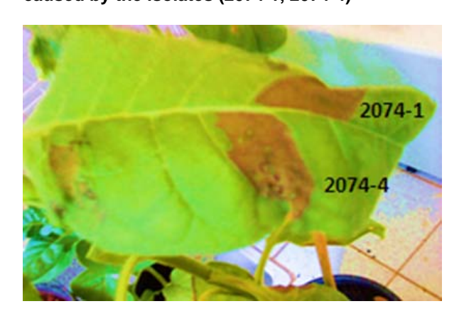
Figure-3. Hypersensitivity reaction in tobacco caused by the isolates (2074-1, 2074-4)

Based on the results of biochemical analysis (gallery API20) ,Tow strains (2074-1,2074-4) showed ability to utilize Citrate (CIT), Sodium Piruvate (VP), Glucose (GLU), Man¬nitol (MAN), Rhamnose (RHA), Sucrose (SAC), Melibiose (MEL), Ortho-Nitro-Phényl Galactoside (ONPG), Arabinose (ARA), and formation of indolepyruvic acid from tryp¬tophan by desaminase tryptophan (TDA) however they aren't able to form the indole from tryptophan but they did not use Lysine (LDC), Ortni¬thine (ODC), Gelatin (GEL), Inositol (INO), Thiosulfate (H2S) , Urea (URE), Sorbitol (SOR). However, the 2066-7 isolate were the same characteristic with a difference